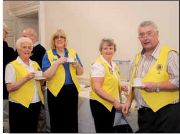
Some of the "Yellow Bellies" of Lincoln Lions having a break from their stewarding