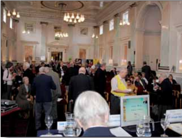
The County Assembly Room, the venue for the Business Session and the Banquet and Ball