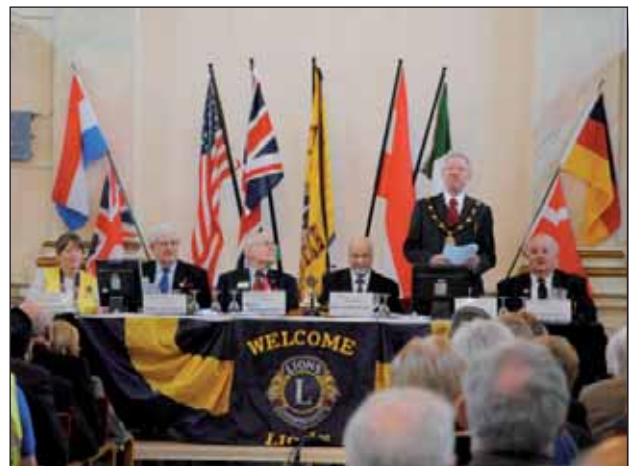
The Mayor of Lincoln formally opens the Business Session