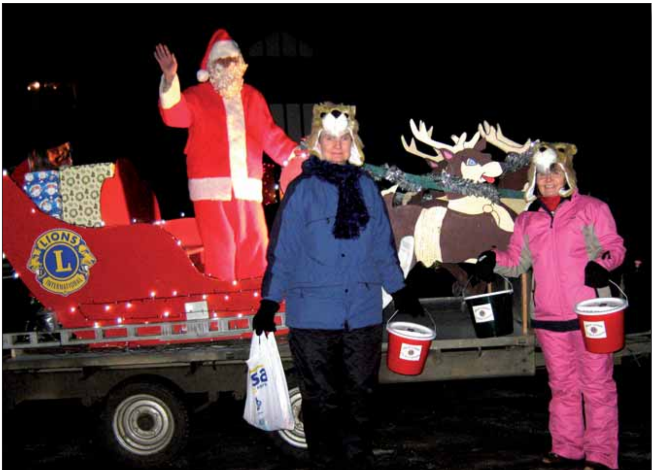
Santa helping Coningsby & Tattershall Lions collect donations in his new sleigh.

With thanks to Lions Corner the Newsletter of Coningsby and Tattershall Lions