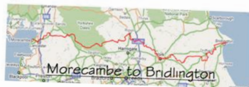
Colin's fundraising banner

Coast to Coast Cycle Ride - 170 miles, solo & camping out en-route. All monies raised to Diabetes UK